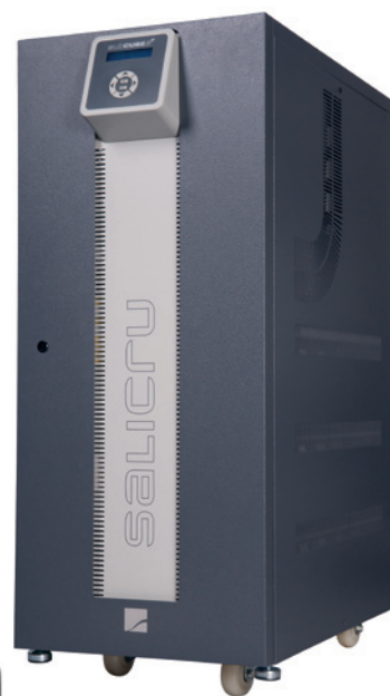
SLC CUBE3 +